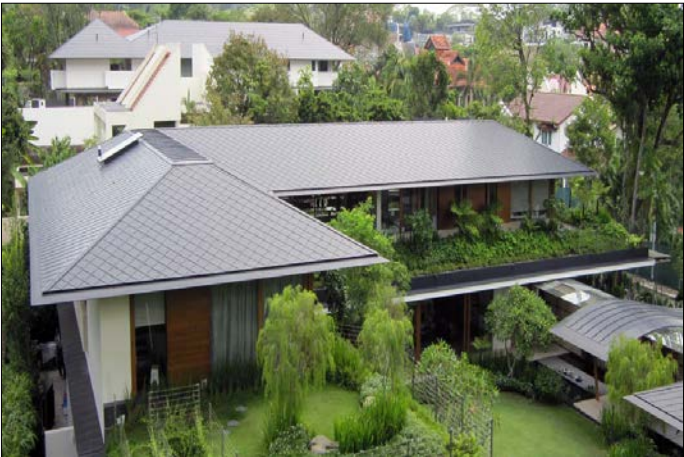
51 UNIVERSITY ROAD