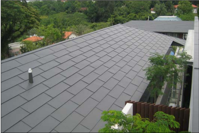
18 & 19A CAMDEN PARK