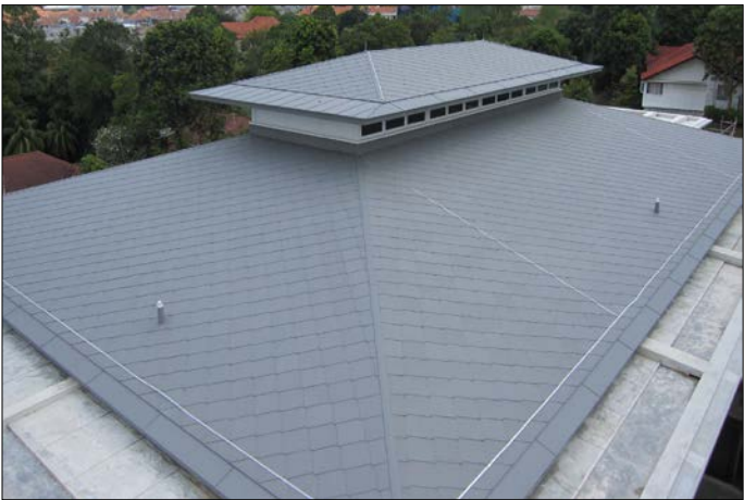
35 & 37 VICTORIA PARK ROAD