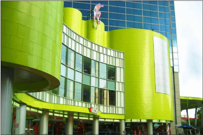
VELOCITY @ NOVENA SQUARE