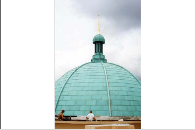
RAFFLES TOWN CLUB